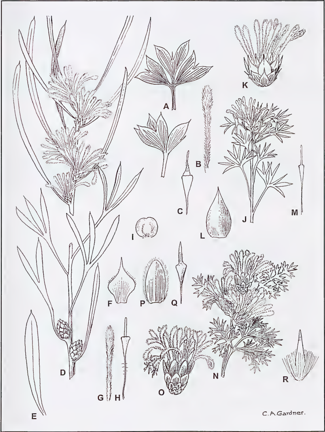
Figure 3. Petrophile illustration drawn by C.A. Gardner (Plate XIII [as XIX] of unpublished bound copy of Flora of Western Australia vol. 1, part 3). A–C. P. biloba . A – leaves; B – flower bud; C – pollen presenter. D–I. P. heterophylla . D – habit; E – leaf; F – floral bract; G – flower bud; H – upper half of style; I – diaspore. J–M. P. squamata var. colorata . J – habit; K – flower head; L – bract; M – pollen presenter. N–R. P. striata . N – habit; O – flower head; P – floral bract; Q – pollen presenter; R – diaspore.